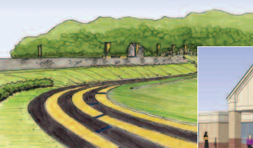
The art above shows the proposed track and field facility for the Lancaster Campus. The artist rendering at right shows the proposed front entrance planned for the Kraybill Campus.