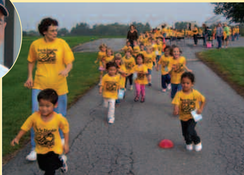
New Danville students participate in their Race for Education event that was held in the fall.