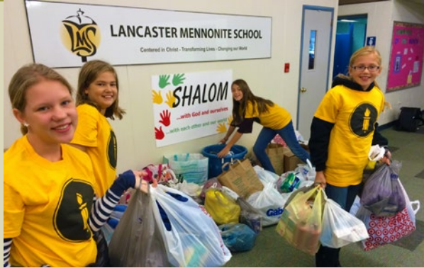
Locust Grove Campus students (pictured), along with other LM campuses, participated in gathering items to make hygiene kits for Syrian refugees this fall that will be distributed by Mennonite Central Committee.

Tickets are $5 for students, $7 for senior citizens and $8 for adults, and may be reserved by calling the box office at 299-0436, ext. 340, or emailing the box office at boxoffice@lancaster-mennonite.org .