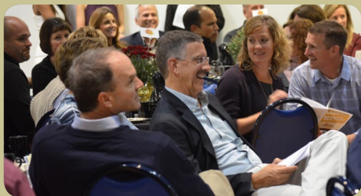
A diverse group of parents, alumni and friends of the school enjoyed the food, fellowship, humor, special presentations and unique merchandise at the benefit auction.

Next year's Fall Festival and Homecoming will be October 7 & 8, 2016.