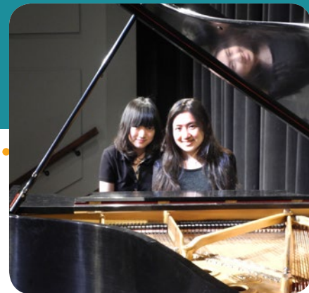
LM students have won numerous music awards such as the Lancaster Symphony Orchestra Competition.

In addition to offering a comprehensive PreK-12 music education program, LM also sponsors the Mennonite Children's Choir as an out-of-school activity in which both LM and non-LM students can participate. With more than