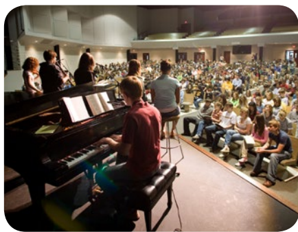
Chapel services are meaningful outlets for musical talent.

A number of other studies demonstrate a connection between music and the development of the brain: instrumental practice enhances coordination, concentration and memory and also brings about the improvement of the entire neurological system, perhaps because music more fully involves brain functions in both left and right hemispheres than other activities.