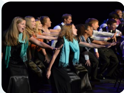
Campus Chorale is an outstanding auditioned performance group for LMH juniors and seniors.

Along with producing some of Pennsylvania's best vocalists and musicians, the LM music program benefits and enriches all students. At all levels, the use of appropriate music reinforces what LM students learn about faith, history, culture and other disciplines. The entire