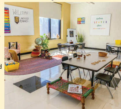
(Above image) Example idea for new elementary classrooms in the Rutt Building.