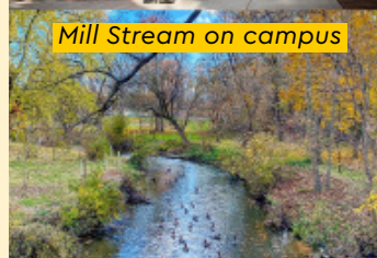
Mill Stream on campus