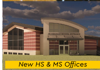
New HS & MS Offices