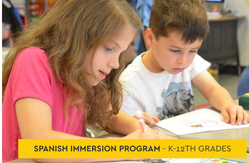
SPANISH IMMERSION PROGRAM - K-12TH GRADES